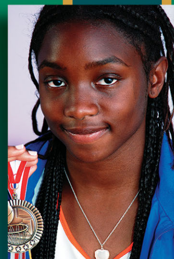
Oneida