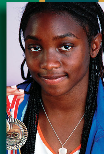
Oneida